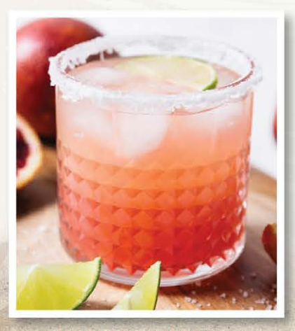
BLOOD ORANGE 9.99