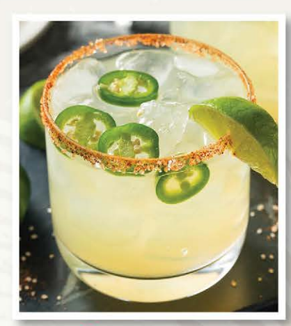
JALAPEÑO MARGARITA 9.99