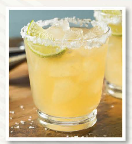
SKINNY MARGARITA 8.99

Top shelf tequila available for exra charge