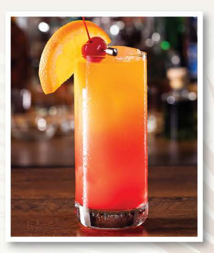
TEQUILA SUNRISE 7.99